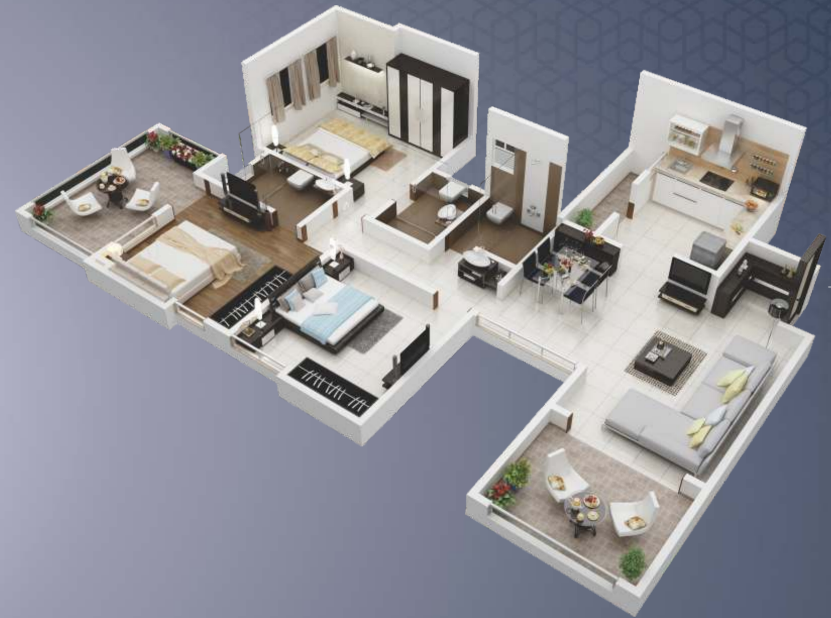
Typical 3 BHK