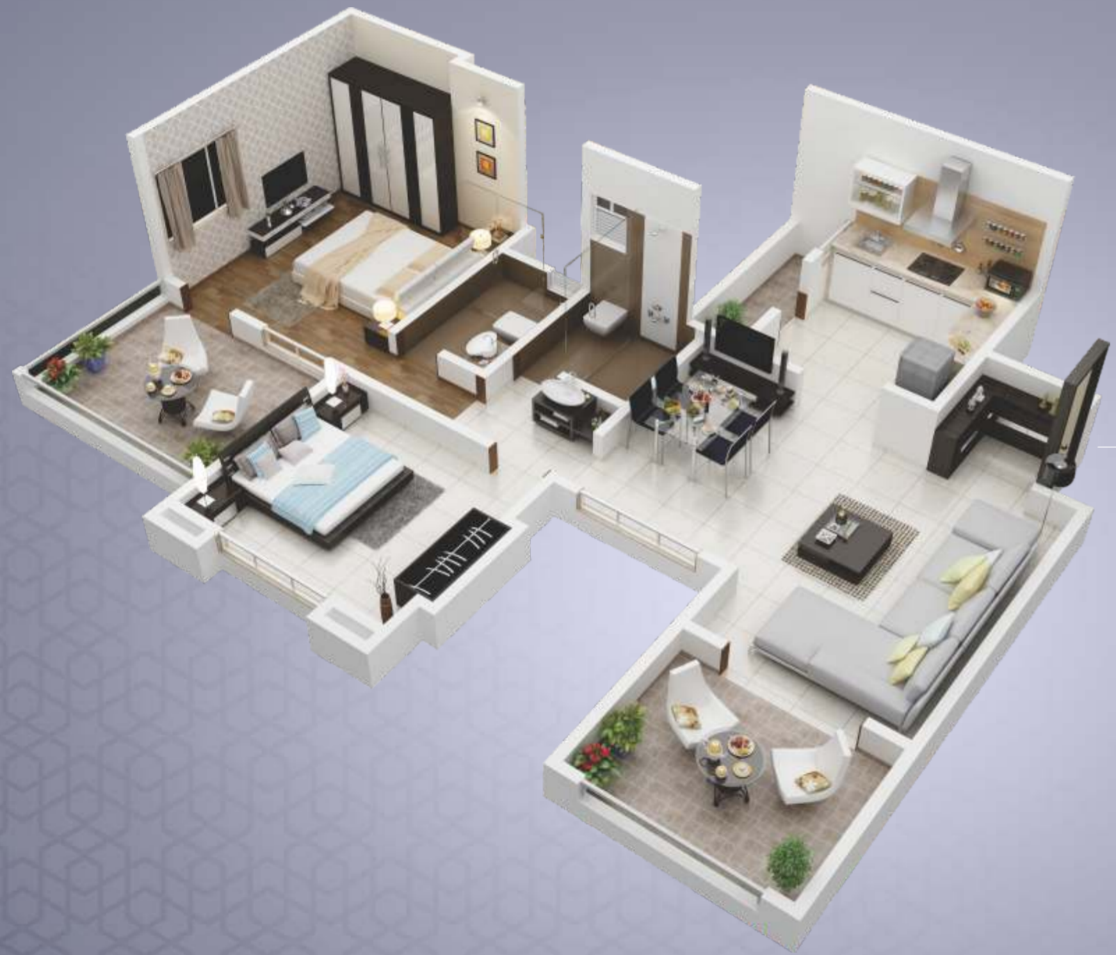
Typical 2 BHK